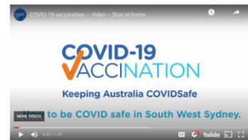
Stay Home during Sydney outbreak