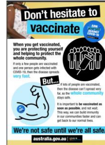
Don't hesitate to vaccinate