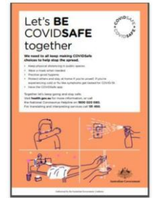
Living the new normal